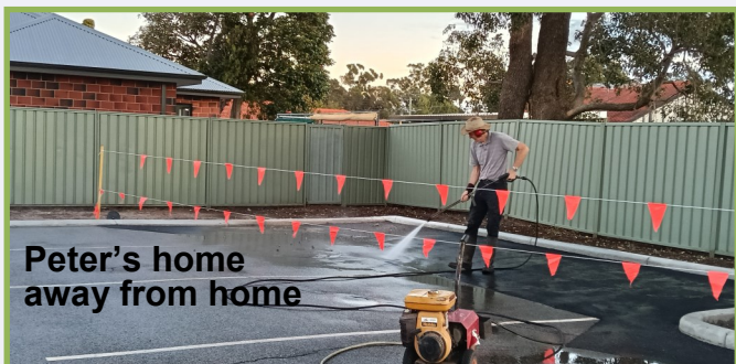
Peter's home away from home

If you have been down to the Church recently you will have seen that the renovations are well under way and that the car park is looking amazing. Another busy bee has been planned. This time to spread the top soil over all the garden areas. The soil will be delivered on Friday 11th July by 1pm. There will be two busy bees to do this work, one at 1.15pm on Fri 11th July and then to finish the work at 1pm on Sat 12th July .